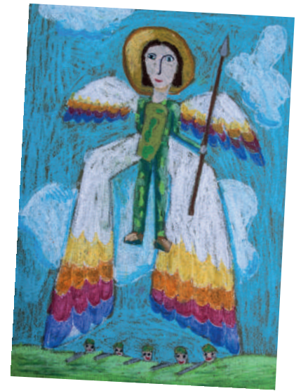
Exhibit 1: Olha Mykhailiuk Children of the Forum are messengers of peace